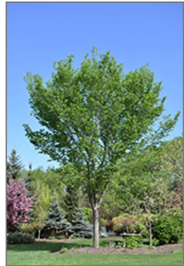
Brandon Elm