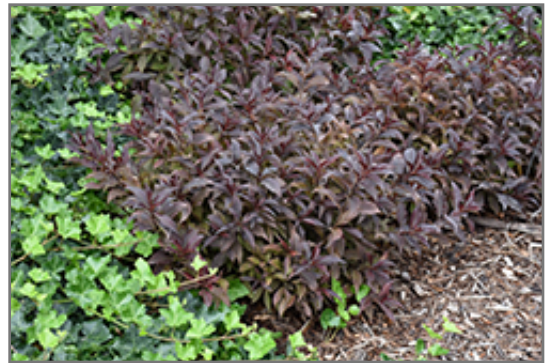
Midnight Wine Weigela

This shrub should only be grown in full sunlight. It prefers to grow in average to moist conditions, and shouldn't be allowed to dry out. It is not particular as to soil type or pH. It is highly tolerant of urban pollution and will even thrive in inner city environments. This is a selected variety of a species not originally from North America.