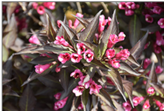
Midnight Wine Weigela flowers