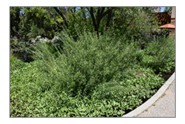
Coyote Willow