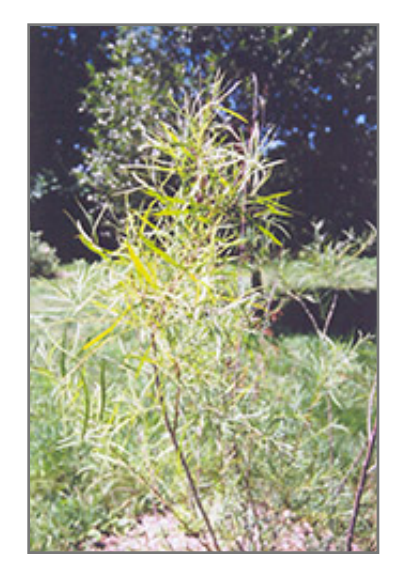
Coyote Willow foliage