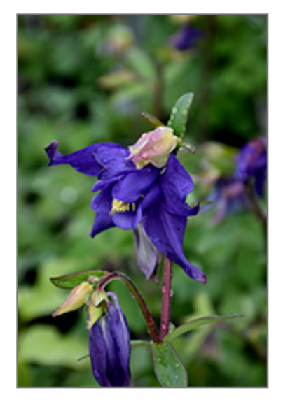
Alpine Columbine flowers

Alpine Columbine is recommended for the following landscape applications;