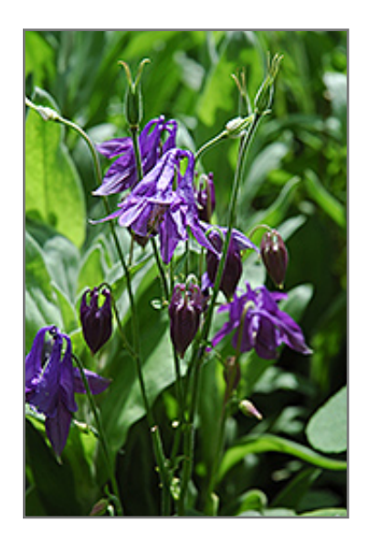
Alpine Columbine flowers