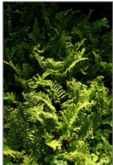
Lady Fern foliage