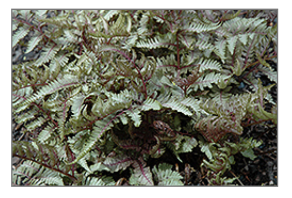
Red Beauty Painted Fern foliage

Attractive tri-color fronds of silver, red and green; colorful maroon-red central stems and veins; compact and dense, perfect for shady spots; beautiful in masses on the edges of ponds or streams