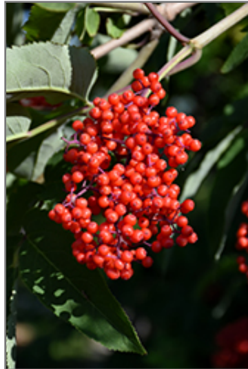
Red Elderberry fruit