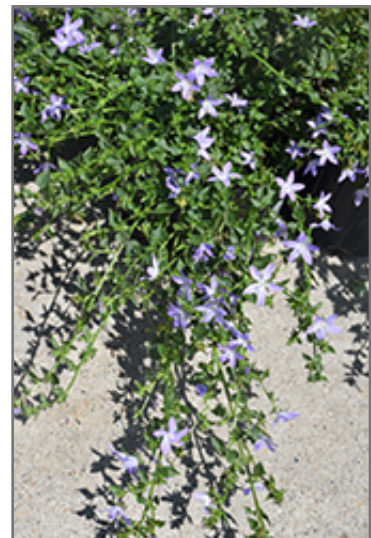
Blue Waterfall Serbian Bellflower in bloom