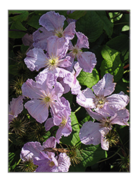
Blue Angel Clematis flowers