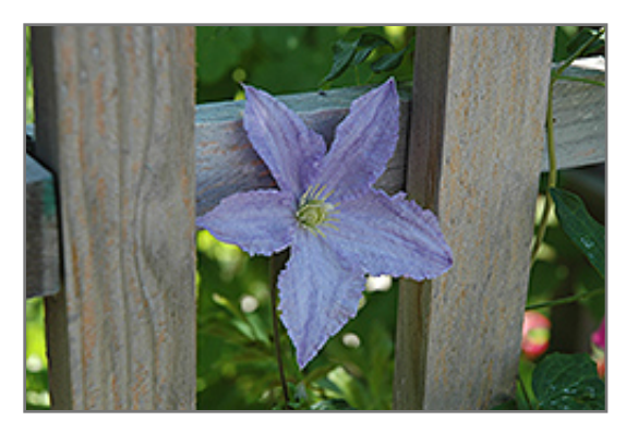
Blue Angel Clematis flowers

Blue Angel Clematis is recommended for the following landscape applications;