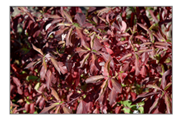
Red Gnome Dogwood in fall

This shrub does best in full sun to partial shade. It is an amazingly adaptable plant, tolerating both dry conditions and even some standing water. It is not particular as to soil type or pH. It is highly tolerant of urban pollution and will even thrive in inner city environments. This is a selected variety of a species not originally from North America.