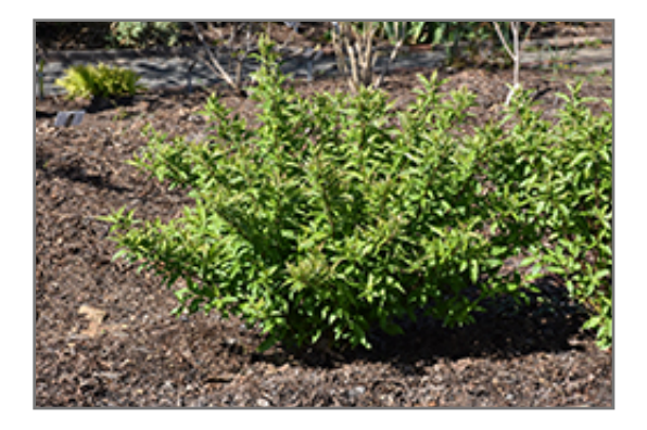
Red Gnome Dogwood