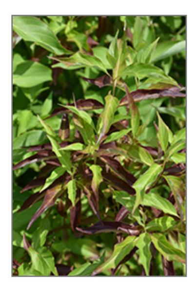
Red Gnome Dogwood foliage