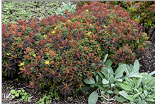
Bonfire Cushion Spurge