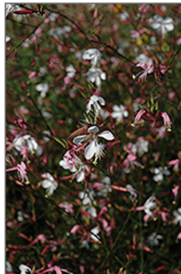
Snowstorm Gaura flowers

This is a relatively low maintenance plant, and is best cleaned up in early spring before it resumes active growth for the season. It is a good choice for attracting butterflies to your yard, but is not particularly attractive to deer who tend to leave it alone in favor of tastier treats. It has no significant negative characteristics.