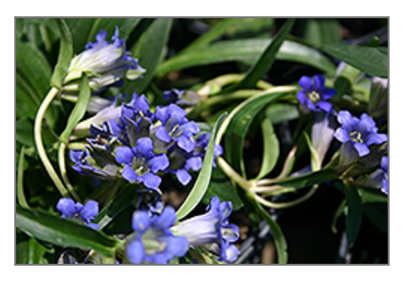
Common Gentian flowers

Dainty and dazzling little blue tubular flowers with white throats steal the show on this cute little plant; doesn't like intense heat, so keep in a part-shade setting, otherwise easy to care for