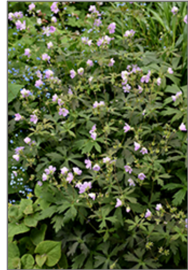
Espresso Cranesbill in bloom

Espresso Cranesbill is a fine choice for the garden, but it is also a good selection for planting in outdoor pots and containers. It is often used as a 'filler' in the 'spiller-thriller-filler' container combination, providing a mass of flowers and foliage against which the thriller plants stand out. Note that when growing plants in outdoor containers and baskets, they may require more frequent waterings than they would in the yard or garden. Be aware that in our climate, most plants cannot be expected to survive the winter if left in containers outdoors, and this plant is no exception. Contact our experts for more information on how to protect it over the winter months.