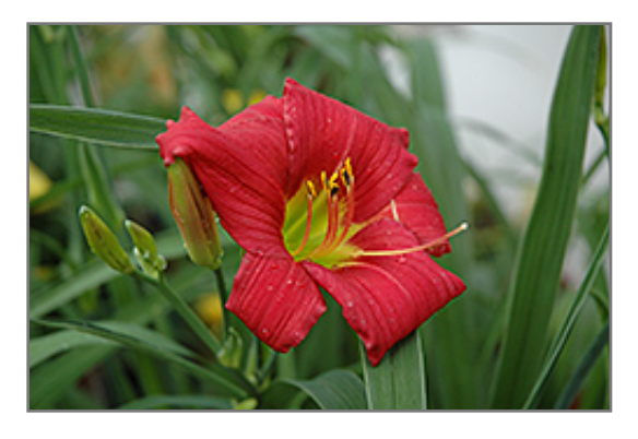
Little Business Daylily flowers