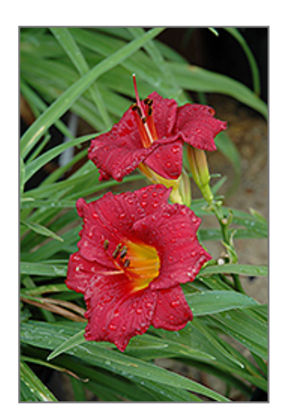
Little Business Daylily flowers