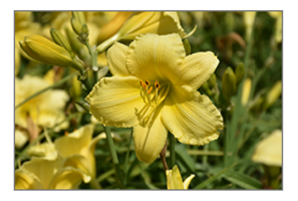
Stella Supreme Daylily flowers