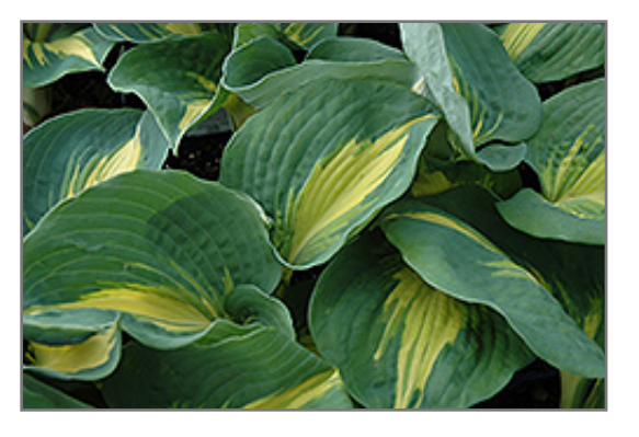
Thunderbolt Hosta foliage