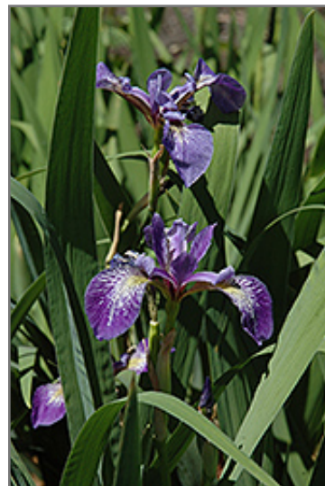
Siberian Iris flowers

Siberian Iris will grow to be about 18 inches tall at maturity extending to 24 inches tall with the flowers, with a spread of 24 inches. When grown in masses or used as a bedding plant, individual plants should be spaced approximately 18 inches apart. It grows at a medium rate, and under ideal conditions can be expected to live for approximately 10 years. As an herbaceous perennial, this plant will usually die back to the crown each winter, and will regrow from the base each spring. Be careful not to disturb the crown in late winter when it may not be readily seen!