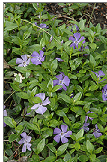
Common Periwinkle in bloom

Common Periwinkle is recommended for the following landscape applications;