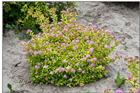
Sundrop Spirea in bloom