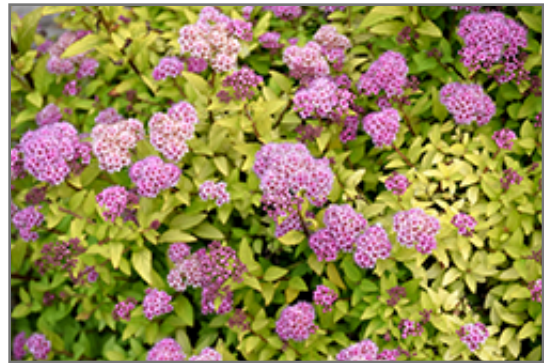
Sundrop Spirea flowers

Sundrop Spirea is recommended for the following landscape applications;