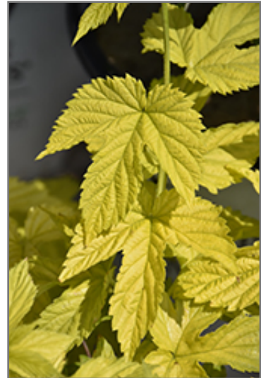
Golden Hops foliage