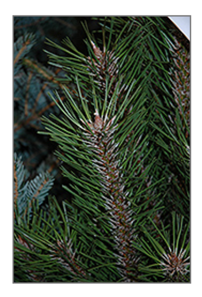
Arnold Sentinel Austrian Pine foliage