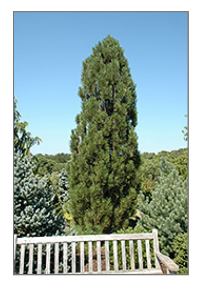
Arnold Sentinel Austrian Pine