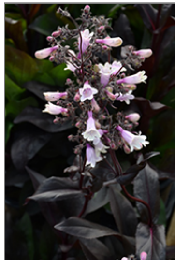
Dark Towers Beard Tongue flowers