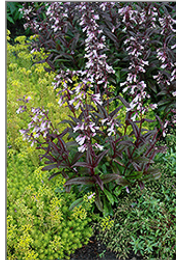
Dark Towers Beard Tongue in bloom