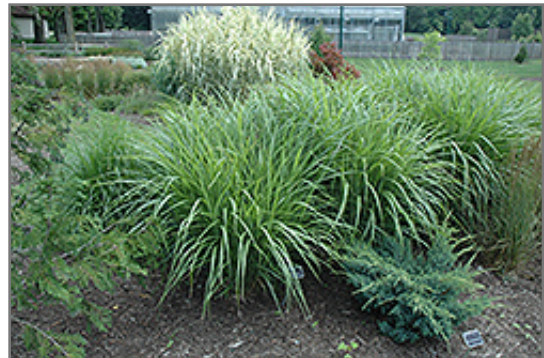
Silberfeder Maiden Grass

Silberfeder Maiden Grass will grow to be about 4 feet tall at maturity, with a spread of 4 feet. It tends to be leggy, with a typical clearance of 1 foot from the ground, and should be underplanted with lower-growing perennials. It grows at a medium rate, and under ideal conditions can be expected to live for approximately 20 years. As an herbaceous perennial, this plant will usually die back to the crown each winter, and will regrow from the base each spring. Be careful not to disturb the crown in late winter when it may not be readily seen!