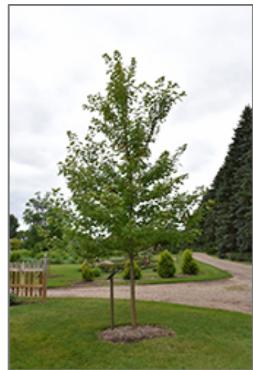
Matador Maple