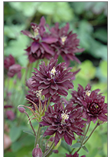
Clementine Dark Purple Columbine flowers