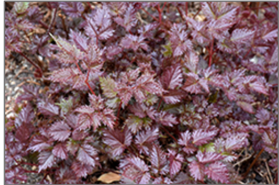
Delft Lace Astilbe foliage

Delft Lace Astilbe will grow to be about 16 inches tall at maturity extending to 24 inches tall with the flowers, with a spread of 12 inches. When grown in masses or used as a bedding plant, individual plants should be spaced approximately 12 inches apart. Its foliage tends to remain dense right to the ground, not requiring facer plants in front. It grows at a medium rate, and under ideal conditions can be expected to live for approximately 10 years. As an herbaceous perennial, this plant will usually die back to the crown each winter, and will regrow from the base each spring. Be careful not to disturb the crown in late winter when it may not be readily seen!