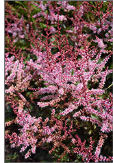
Delft Lace Astilbe flowers

This is a relatively low maintenance plant, and is best cleaned up in early spring before it resumes active growth for the season. It is a good choice for attracting butterflies to your yard, but is not particularly attractive to deer who tend to leave it alone in favor of tastier treats. It has no significant negative characteristics.