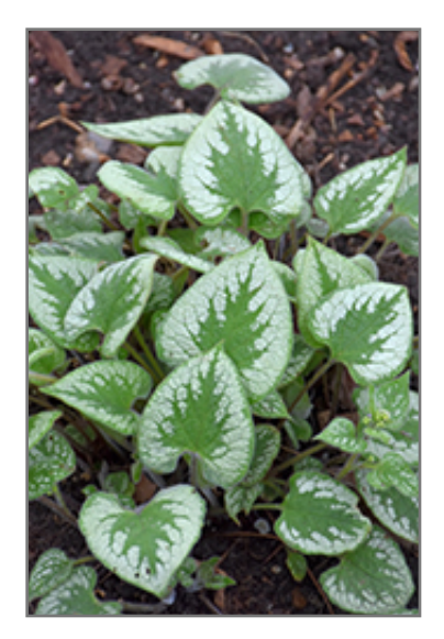
Emerald Mist Bugloss foliage