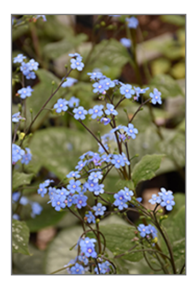
Emerald Mist Bugloss flowers