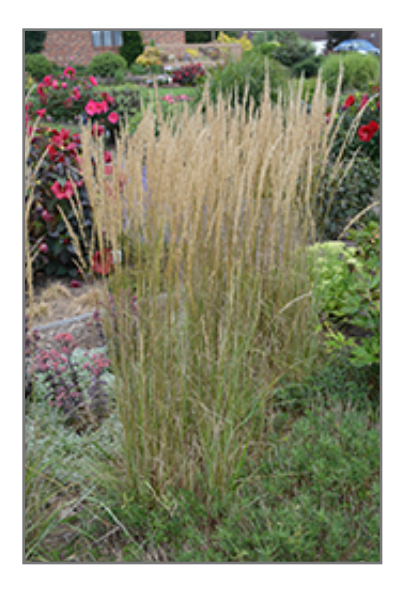
El Dorado Feather Reed Grass