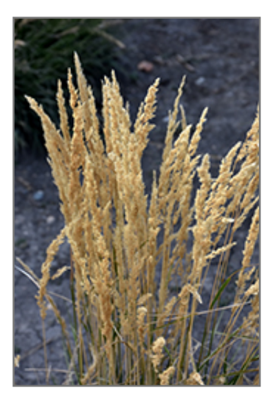
El Dorado Feather Reed Grass fruit

El Dorado Feather Reed Grass is a fine choice for the garden, but it is also a good selection for planting in outdoor pots and containers. Because of its height, it is often used as a 'thriller' in the 'spiller-thriller-filler' container combination; plant it near the center of the pot, surrounded by smaller plants and those that spill over the edges. It is even sizeable enough that it can be grown alone in a suitable container. Note that when growing plants in outdoor containers and baskets, they may require more frequent waterings than they would in the yard or garden. Be aware that in our climate, most plants cannot be expected to survive the winter if left in containers outdoors, and this plant is no exception. Contact our experts for more information on how to protect it over the winter months.