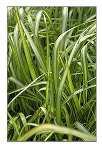
El Dorado Feather Reed Grass foliage