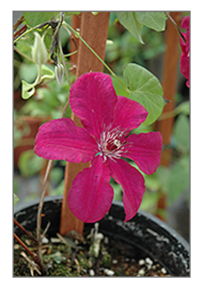
Kardinal Wyszynski Clematis flowers