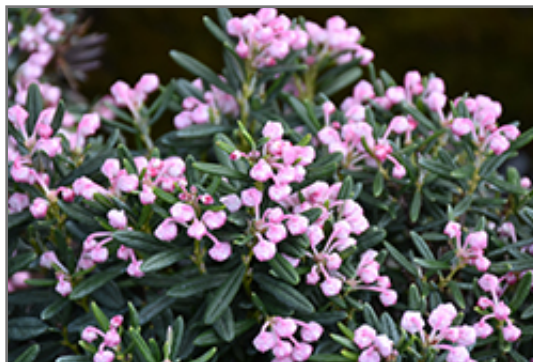
Blue Ice Bog Rosemary flowers