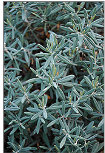
Blue Ice Bog Rosemary foliage

This shrub does best in full sun to partial shade. It prefers to grow in moist to wet soil, and will even tolerate some standing water. It is not particular as to soil type, but has a definite preference for acidic soils, and is subject to chlorosis (yellowing) of the foliage in alkaline soils. It is somewhat tolerant of urban pollution, and will benefit from being planted in a relatively sheltered location. Consider applying a thick mulch around the root zone in winter to protect it in exposed locations or colder microclimates. This is a selection of a native North American species.