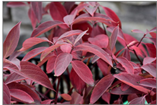
Arctic Fire Red Twig Dogwood in fall

This shrub does best in full sun to partial shade. It is an amazingly adaptable plant, tolerating both dry conditions and even some standing water. It is not particular as to soil type or pH. It is highly tolerant of urban pollution and will even thrive in inner city environments. This is a selection of a native North American species.