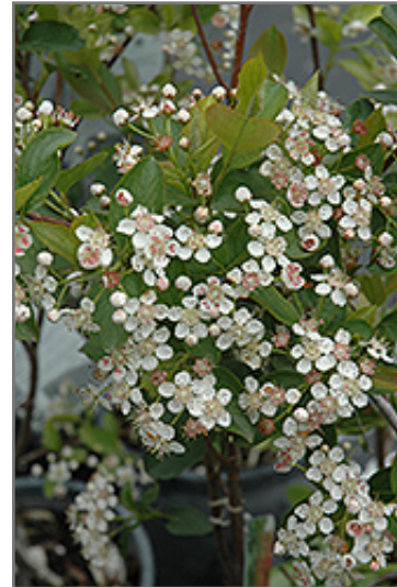
Viking Chokeberry flowers