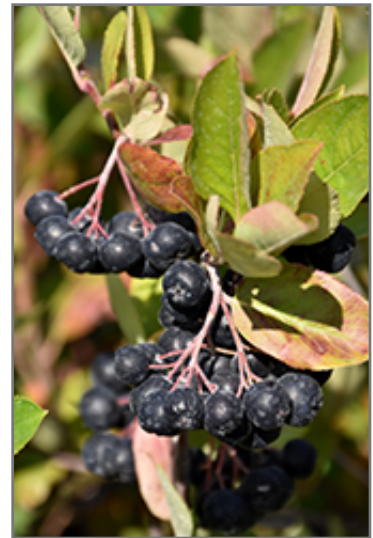
Viking Chokeberry fruit

This shrub should only be grown in full sunlight. It is an amazingly adaptable plant, tolerating both dry conditions and even some standing water. It is not particular as to soil type or pH, and is able to handle environmental salt. It is somewhat tolerant of urban pollution. This particular variety is an interspecific hybrid.