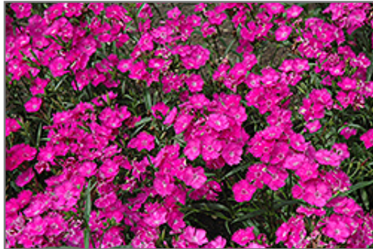
Bouquet Purple Pinks in bloom