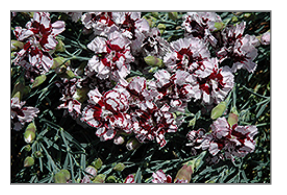
Coconut Punch Pinks flowers