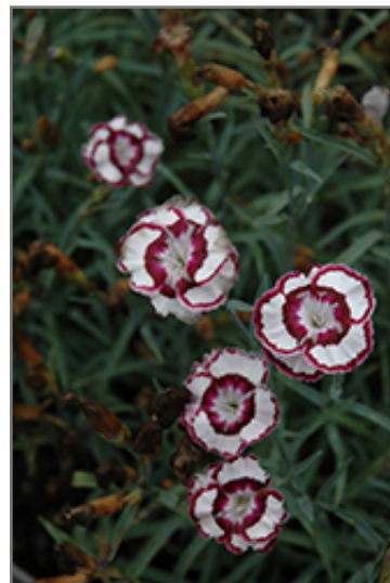
Raspberry Swirl Pinks flowers

Raspberry Swirl Pinks is recommended for the following landscape applications;