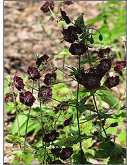
Samobor Cranesbill in bloom

Samobor Cranesbill is recommended for the following landscape applications;