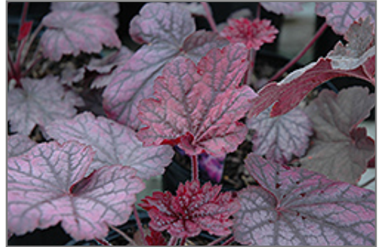
Midnight Bayou Coral Bells foliage

Midnight Bayou Coral Bells is recommended for the following landscape applications;