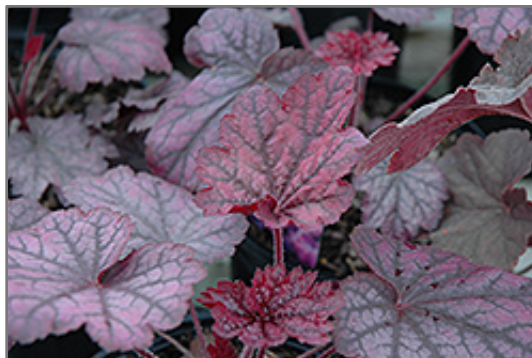
Midnight Bayou Coral Bells foliage

Midnight Bayou Coral Bells is recommended for the following landscape applications;