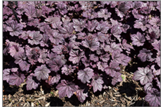
Sugar Plum Coral Bells

Sugar Plum Coral Bells will grow to be about 12 inches tall at maturity extending to 24 inches tall with the flowers, with a spread of 18 inches. When grown in masses or used as a bedding plant, individual plants should be spaced approximately 15 inches apart. Its foliage tends to remain dense right to the ground, not requiring facer plants in front. It grows at a medium rate, and under ideal conditions can be expected to live for approximately 10 years. As an evergreen perennial, this plant will typically keep its form and foliage year-round.