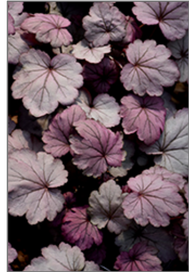
Sugar Plum Coral Bells foliage

Sugar Plum Coral Bells is recommended for the following landscape applications;