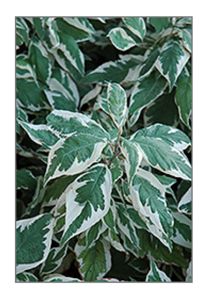
Ivory Halo Dogwood foliage