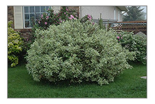
Ivory Halo Dogwood