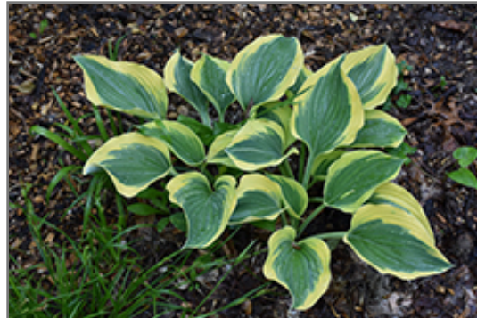
Liberty Hosta