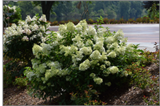
Little Lime Hydrangea in bloom

This shrub performs well in both full sun and full shade. It prefers to grow in average to moist conditions, and shouldn't be allowed to dry out. It is not particular as to soil type or pH. It is highly tolerant of urban pollution and will even thrive in inner city environments. Consider applying a thick mulch around the root zone in winter to protect it in exposed locations or colder microclimates. This is a selected variety of a species not originally from North America.