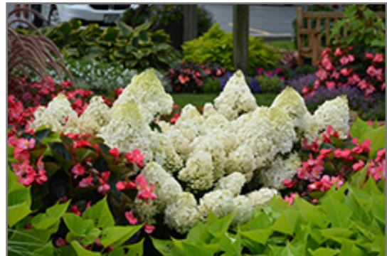
Little Lime Hydrangea flowers