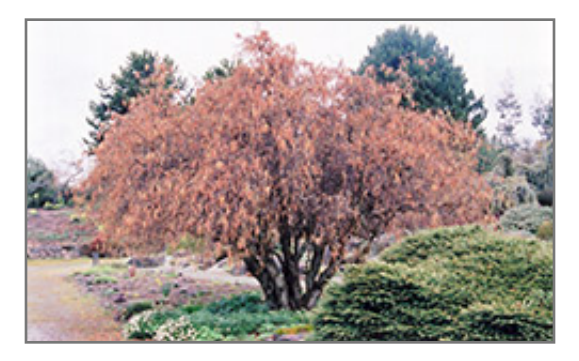
Harry Lauder's Walking Stick in winter

This is a high maintenance shrub that will require regular care and upkeep, and is best pruned in late winter once the threat of extreme cold has passed. Gardeners should be aware of the following characteristic(s) that may warrant special consideration;