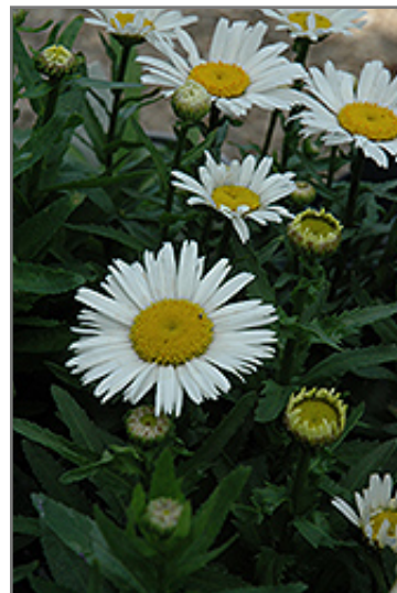
Snow Lady Shasta Daisy flowers

Snow Lady Shasta Daisy is recommended for the following landscape applications;