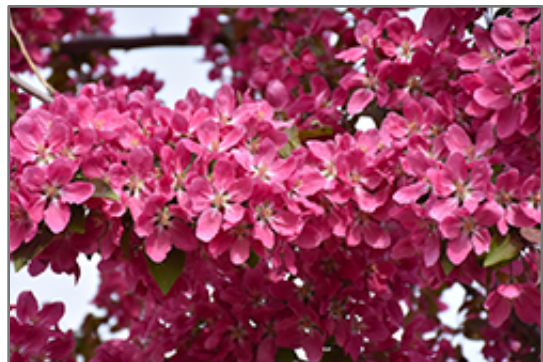
Big River Flowering Crab flowers