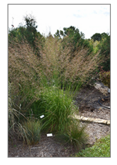
Skyracer Moor Grass