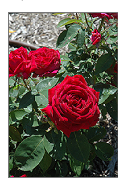
Kashmir Rose flowers