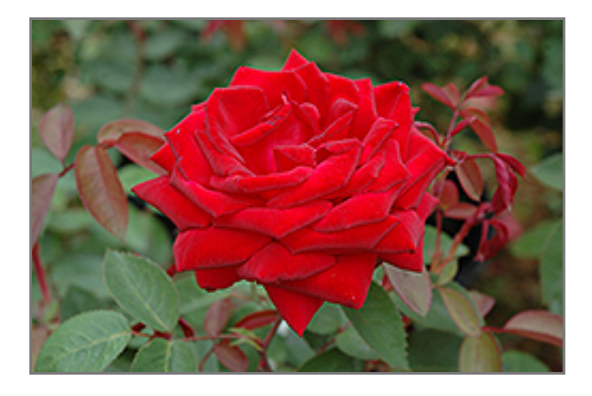
Kashmir Rose flowers

Kashmir Rose is recommended for the following landscape applications;