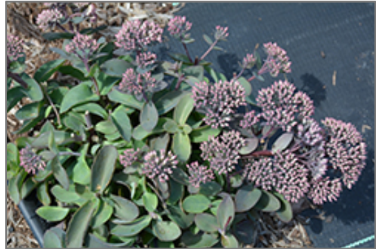
Chocolate Drop Stonecrop flower buds