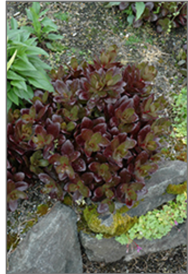
Chocolate Drop Stonecrop

Chocolate Drop Stonecrop is a dense herbaceous perennial with an upright spreading habit of growth. Its relatively coarse texture can be used to stand it apart from other garden plants with finer foliage.