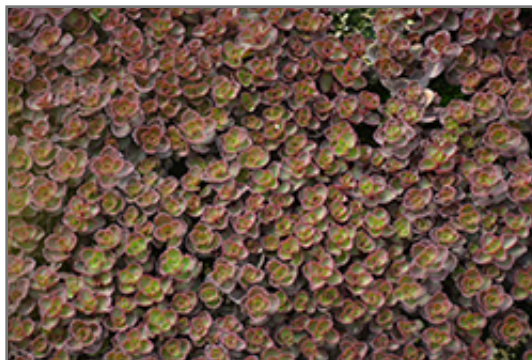
Bronze Carpet Stonecrop foliage