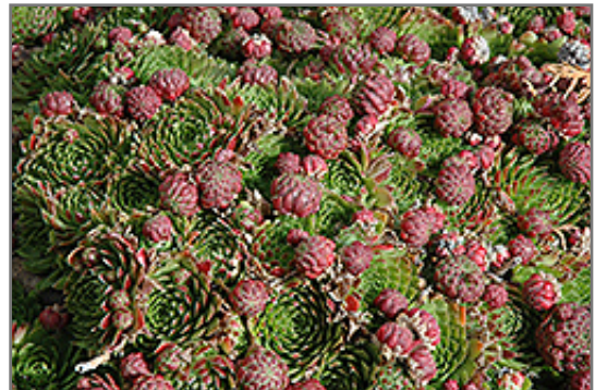
Red Beauty Hens And Chicks

This plant will require occasional maintenance and upkeep, and should not require much pruning, except when necessary, such as to remove dieback. Deer don't particularly care for this plant and will usually leave it alone in favor of tastier treats. Gardeners should be aware of the following characteristic(s) that may warrant special consideration;